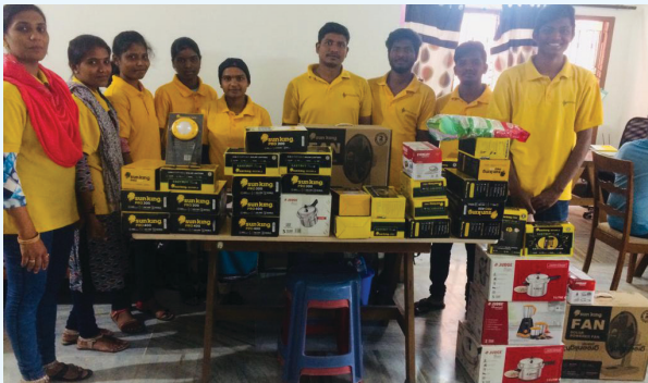
The Hyderabad Pollinator team getting together for a monthly stock check. Three of the female pollinators are part of the Peak program.

The support that PEAK has provided has resulted in significant progress within Hyderabad. This includes an increase in recruitment and training activities and strong sales results.